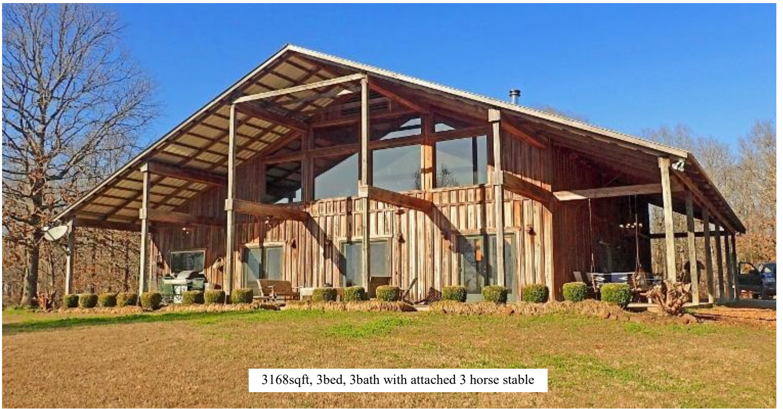
3168sqft, 3bed, 3bath with attached 3 horse stable