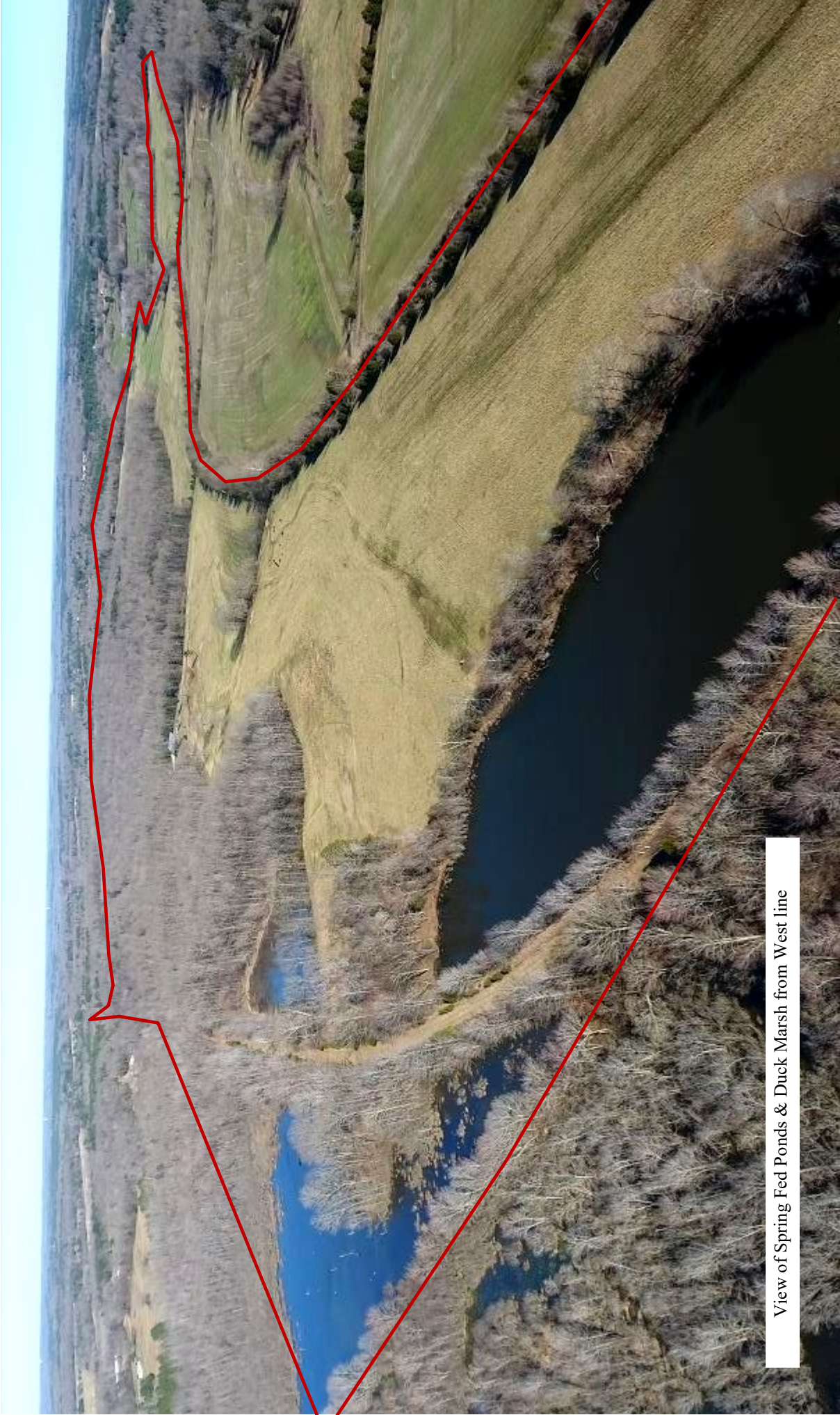
View of Spring Fed Ponds & Duck Marsh from West line