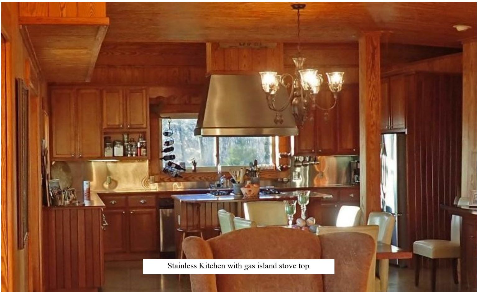
Stainless Kitchen with gas island stove top