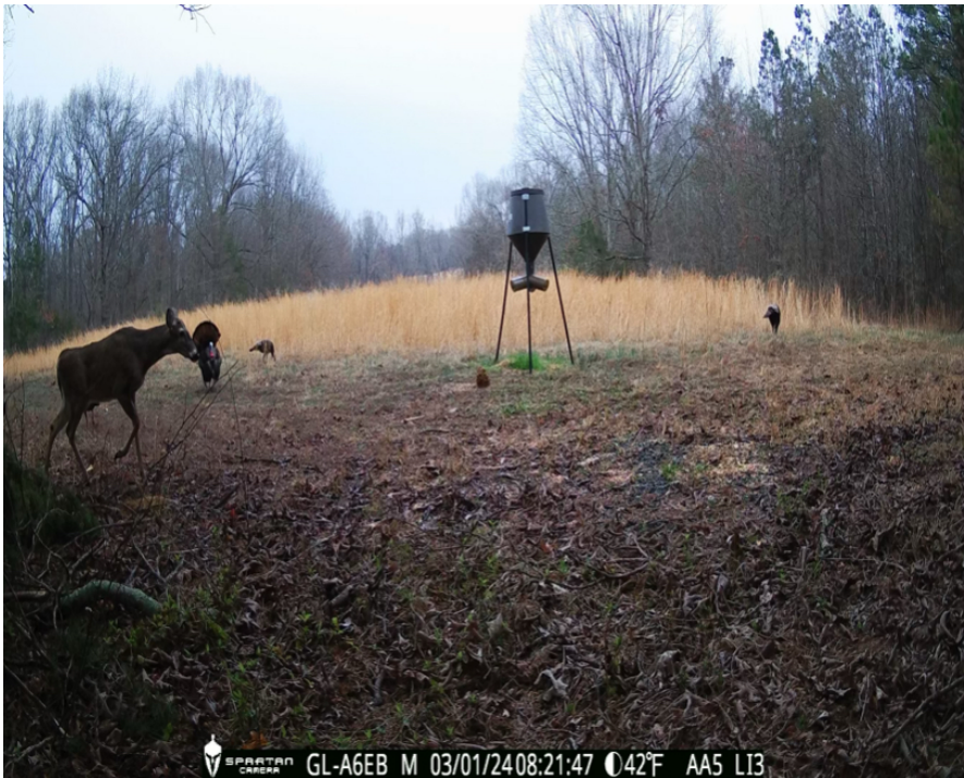
SPARCO CAMERA GL-A6EB M 03/01/24 08:21:47 42°F AA5 LI3