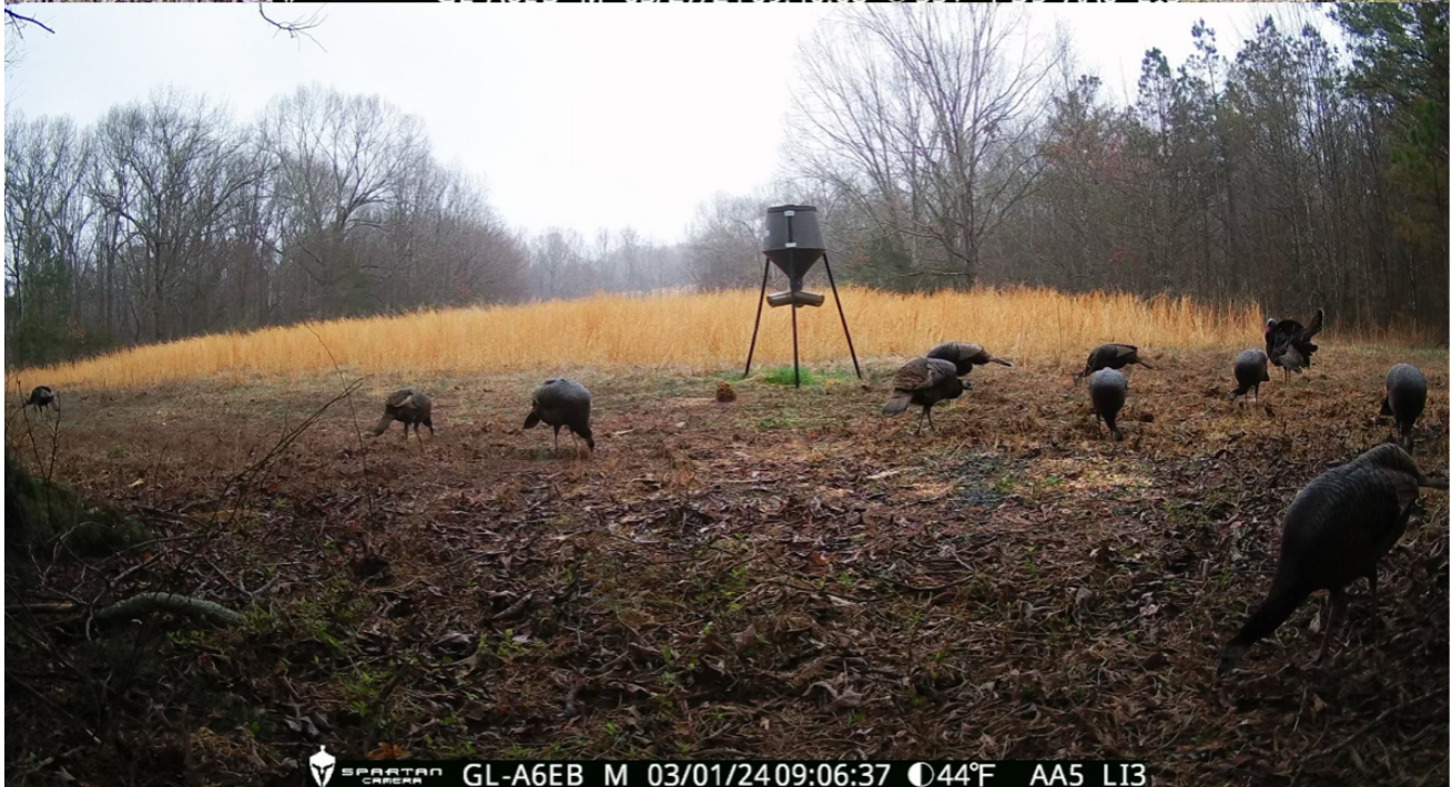
SPARCO CAMERA GL-A6EB M 03/01/24 09:06:37 44°F AA5 LI3