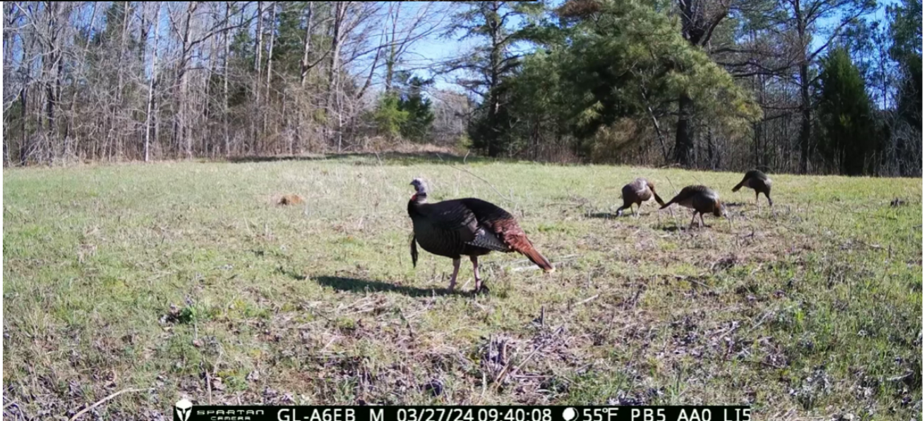
SPARCO CAMERA GL-A6EB M 03/27/24 09:40:08 55°F PB5 AA0 LI5