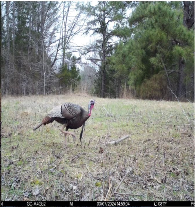
GC-A4Gb2 M 03/07/2024 14:59:04 081°F P5